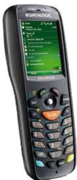
Fig. 1: Sample PDA

PrintLab's flexibility also is frequently used by POS or hosting systems in two situations. First, it can be used with handheld devices (FM units) that create tag requests using their handheld device. This request can then be printed. Alternatively, the customer may complement this data with data contained in the Data Compliment Module (optional item).