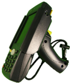
Fig. 1: Sample PDA

PrintLab's flexibility also is frequently used by POS or hosting systems in two situations. First it can be used with handheld devices (FM units) that create tag requests using their handheld device. This request can then be printed. Alternatively, the customer may complement this data with data contained in the Data Compliment Module (optional item).